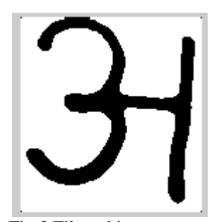
Fig.3 Filtered image

The data for 20 Devnagari characters is collected with the help of the Image object. This data is then converted into pixels. Fig.3 shows the Filtered image From this the part of the image which contains character is cropped out. The character image is then down sampled to get a 5 \times 7 matrix. Fig.4 shows the binary form of image. This 5 \times 7 matrix is then converted to a input vector of length 1 \times 35 . This is a binary vector and represents a stream of 0s and 1s. Thus for a 20 characters a training set of 20 input vectors is formed.